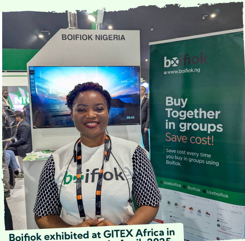
Boifiok exhibited at GITEX Africa in Marrakesh, Morocco in April, 2025

We will be hosting venture showcase and demo day for home grown startups in the region at the 2025 Akwa Ibom Tech Week. " One of our core objectives is to democratize access to resources, networking and funding for startups and businesses in the region. It is our mission to empower local talent and nurture entrepreneurship in the state.